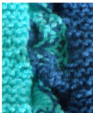
Photo above shows left leaning cables: 8-st LC-b, where B crosses over A and 8-st LC-a, where A crosses over to B (back to its original position).

Photo at right shows yarn woven in as pattern is worked.